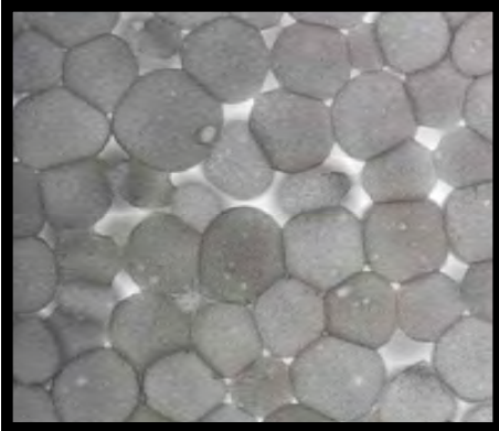
Surface of EPS beads coated with imidacloprid.

LOGIX is used to construct residential and commercial buildings throughout North America, including areas of high insect infestation. In areas noted as "very heavy" termite infestation, the IRC and IBC (International Residential Code and International Building Code, respectively) require foam plastic to be protected against termite damage.