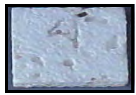
Termite attack on EPS treated with Borate.