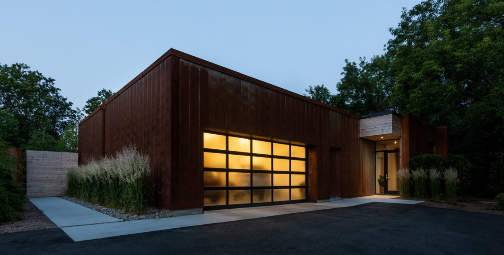
The East City Residence - 2021 Logix Award Winner, Most Outstanding Large Residential Project